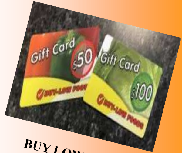
BUY LOW FOODS

No cost to you. Purchase the store cards at face value in denominations of $50, $100