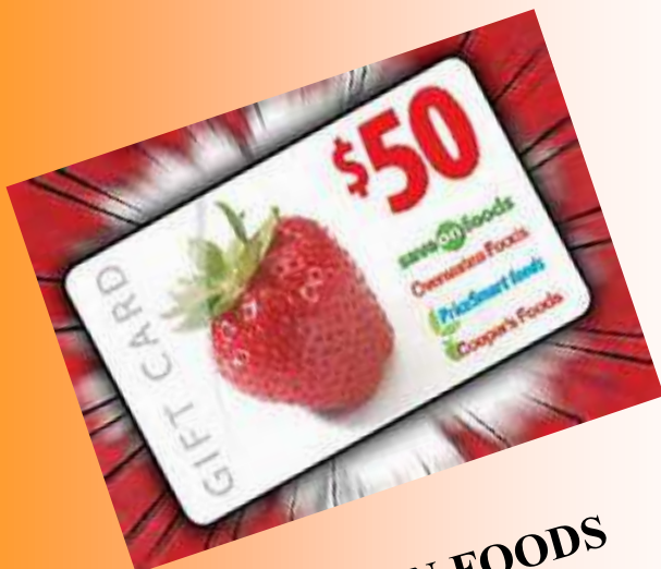
SAVE ON FOODS

Buy-Low Foods – 10% - $10.00 for every $100 spent